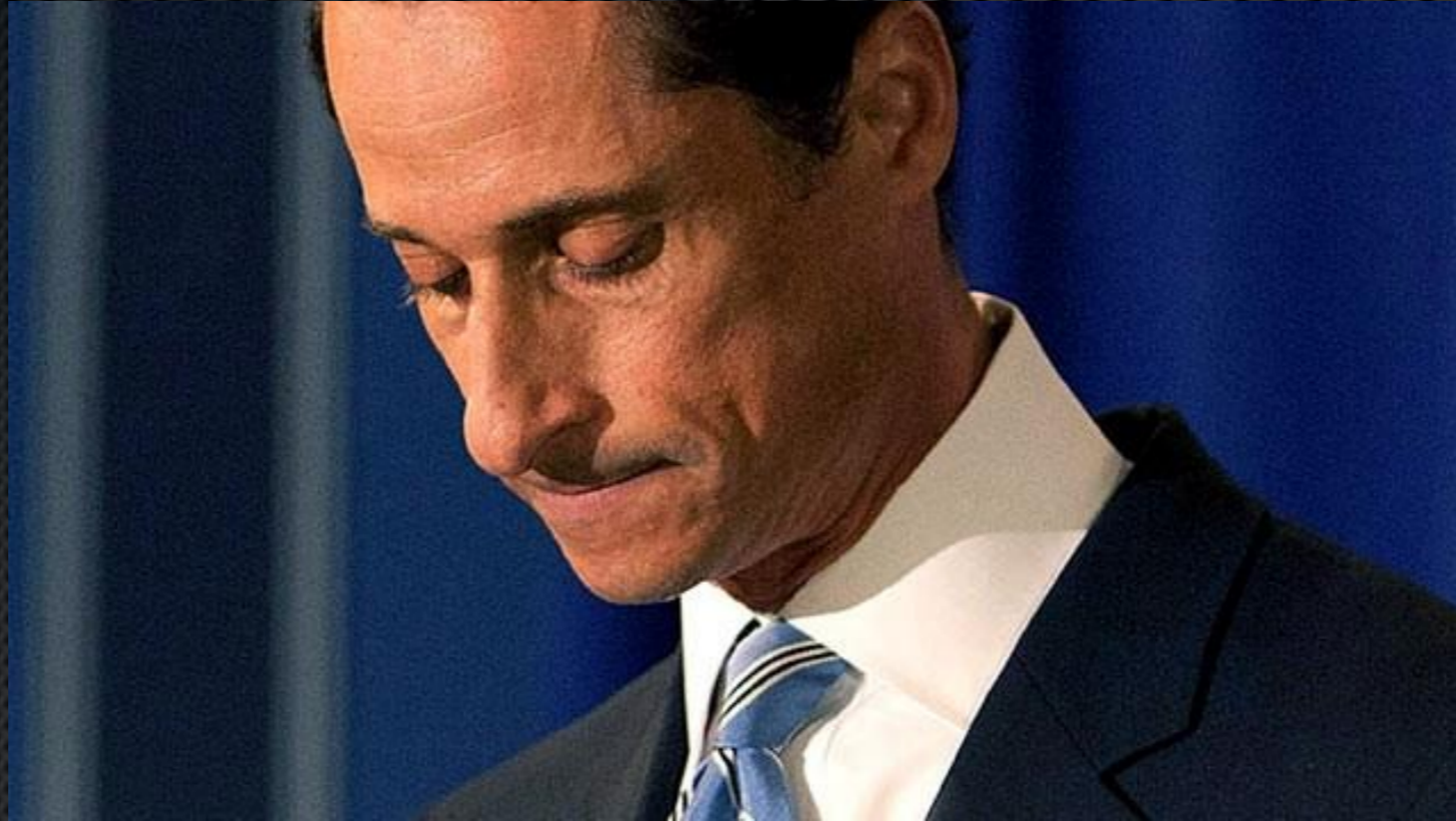
Hon. A. Weiner